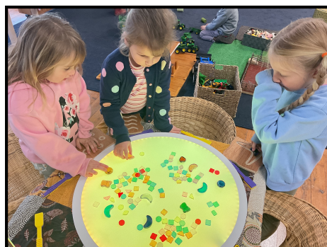
Above; Aria, Lottie and Matilda experimenting at the light table.

fun adventures and visits together. We can't wait - watch this space!