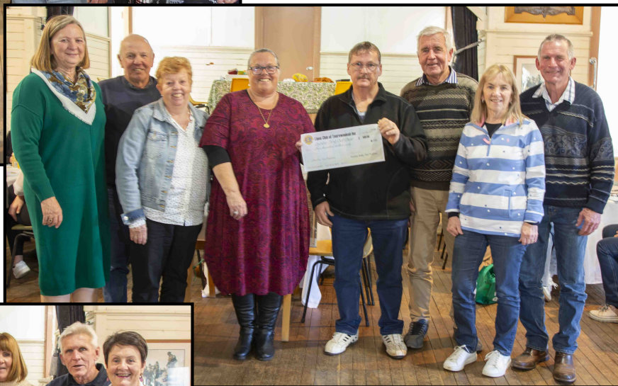
Left: 4th 'Hazelton's Mountain Goats' recipient Wings for Kids $500

Top job Toora Lions and Trivia Tragic's to gift away $5,000, all those groups would be thrilled. Such a wonderful volunteering spirit!