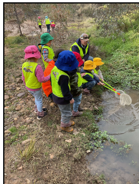
Above; We love using the Yabby nets and we were so excited to find lots of Yabby claws along the edge of the pond.