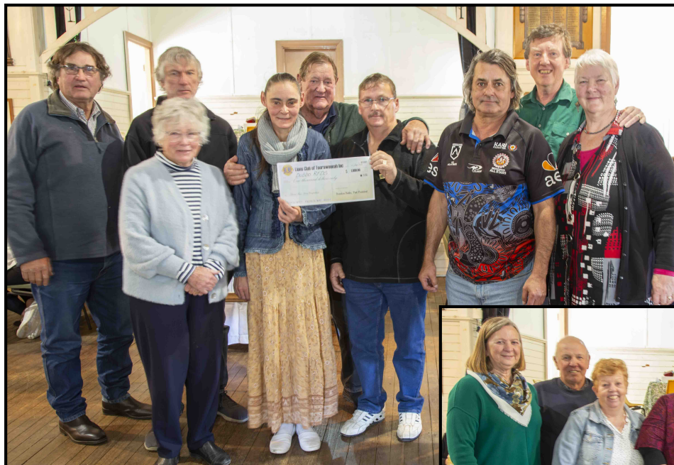
Above: 2nd place 'Pike's Pikelets' recipient RFDS $1,000.