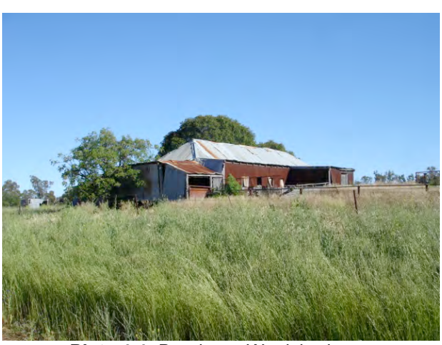
Plate 4.4: Bearbong Woolshed.