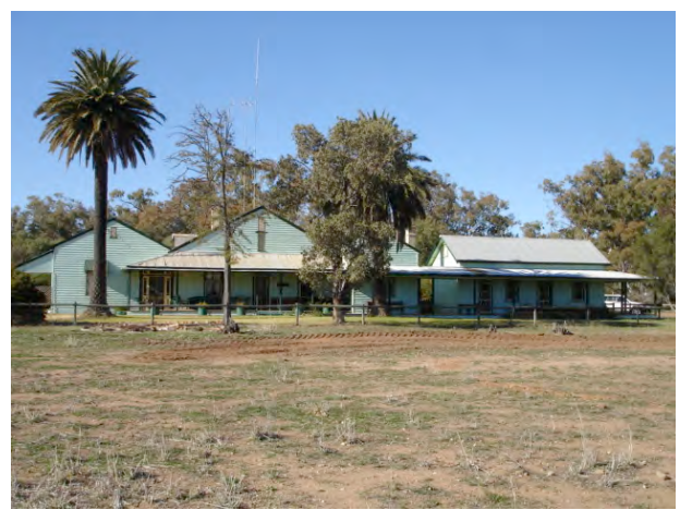
Plate 4.3: Berida Homestead.

The Pastoral and Agricultural landscape of Gilgandra Shire has undergone constant change since the 1830s. The story of the shire illustrates a continuum of change from large pastoral lease-holdings to substantial freehold properties that were gradually broken up through the late 19<sup>th</sup> and early to mid 20<sup>th</sup> centuries. Most early Pastoral holdings had a myriad of outbuildings and functioned effectively as small villages with store, housing of various types, schooling, wool shed, and private cemeteries. Many of these places today retain fine examples of great timber craftsmanship in both major and minor constructions, and reflect the energy and perseverance of strong individuals. Some notable examples can be found at Berida, Dooroombah and Weenya. Closer settlement created smaller holdings around locations such as Armatree, Biddon, Breelong and Tooraweenah. The woolsheds at Bearbong, Berida, Everleigh and Dooroombah help to represent changes in the scale of pastoral activity.