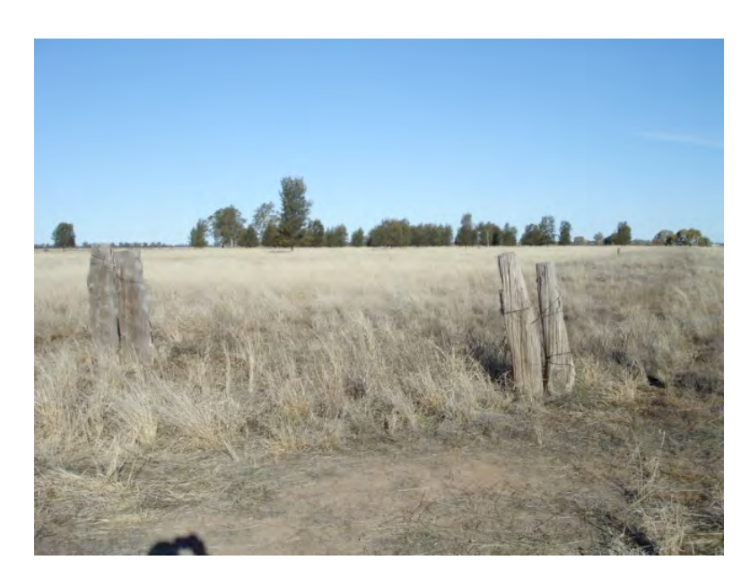
Plate 4.9: A gateway and section of corduroy road on the East Coonamble Road marked as the Corduroy Road Historic Site.

townships. Coaching routes also followed the rivers and changing stations were established at regular intervals. A unique legacy of these routes exists in the remnants of corduroy road located along the East Coonamble Road north of Curban.