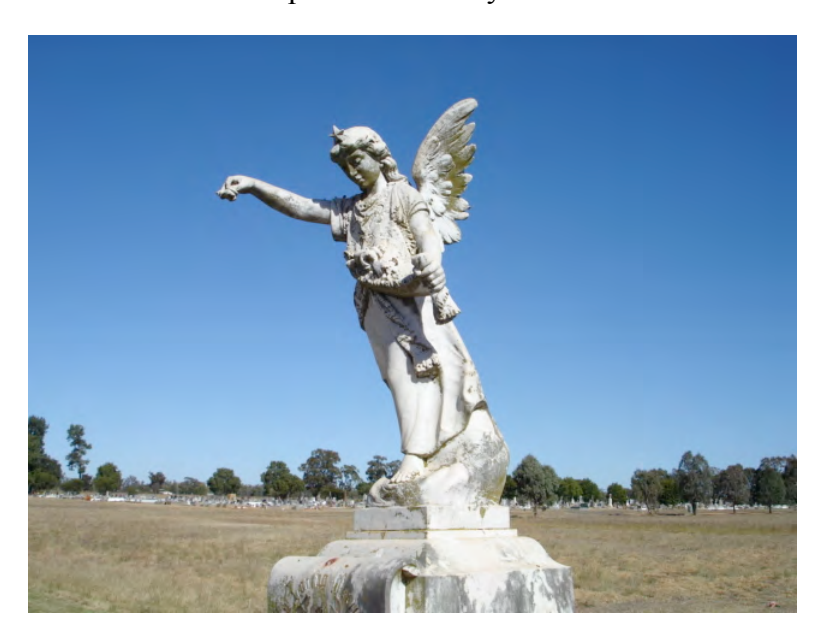
Plate 4.10: Monument in Gilgandra General Cemetery.

Rituals of death are most prominently displayed in cemeteries. These places also provide indications of both the faith and wealth of an area's inhabitants. Gilgandra has a well established General Cemetery with many fine monuments. Curban has its own general cemetery and small family graveyards are scattered around the shire. Among these are the Dicks Family private cemetery at Bearbung, the Sunnyside private cemetery near Armatree and Woodvale Park private cemetery near Curban.