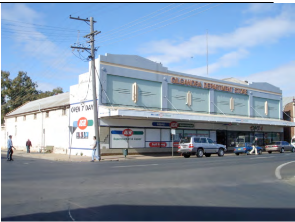
Plate 4.6: The former Western Stores on the corner of Miller and Bridge Streets.