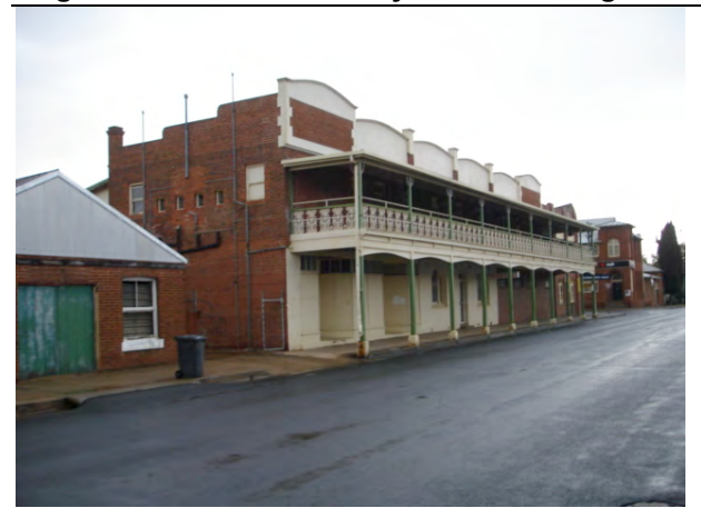
Plate 4.5: Royal Hotel frontage looking south along Bridge Street.