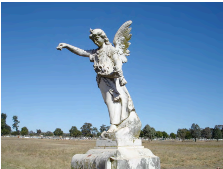
Plate 4.10: Monument in Gilgandra General Cemetery.

Rituals of death are most prominently displayed in cemeteries. These places also provide indications of both the faith and wealth of an area's inhabitants. Gilgandra has a well established General Cemetery with many fine monuments. Curban has its own general cemetery and small family graveyards are scattered around the shire. Among these are the Dicks Family private cemetery at Bearbung, the Sunnyside private cemetery near Armatree and Woodvale Park private cemetery near Curban.