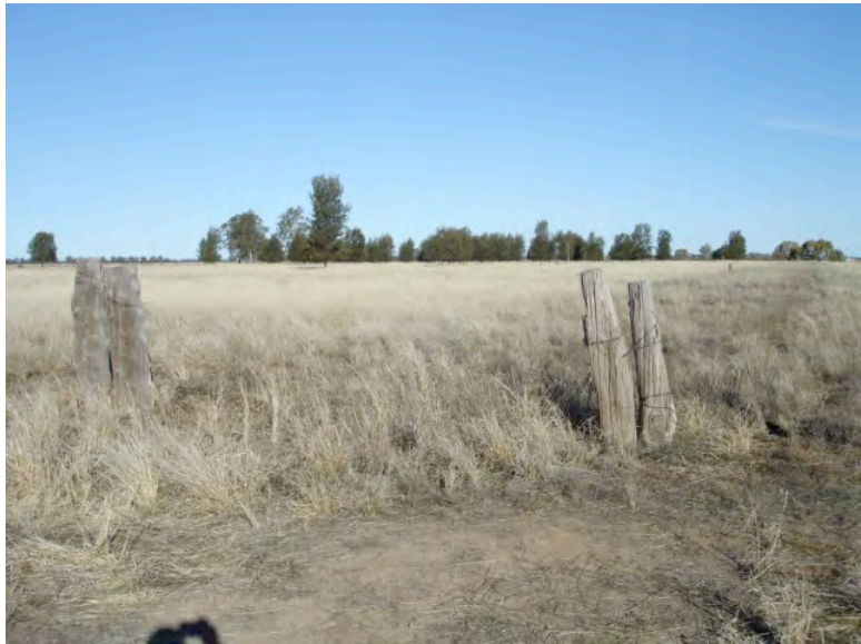
Plate 4.9: A gateway and section of corduroy road on the East Coonamble Road marked as the Corduroy Road Historic Site.

townships. Coaching routes also followed the rivers and changing stations were established at regular intervals. A unique legacy of these routes exists in the remnants of corduroy road located along the East Coonamble Road north of Curban.