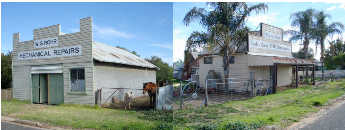
Plates 4.7 & 4.8: Tooraweenah's preserved timber-framed commercial buildings provide Gilgandra Shire with a unique heritage resource.