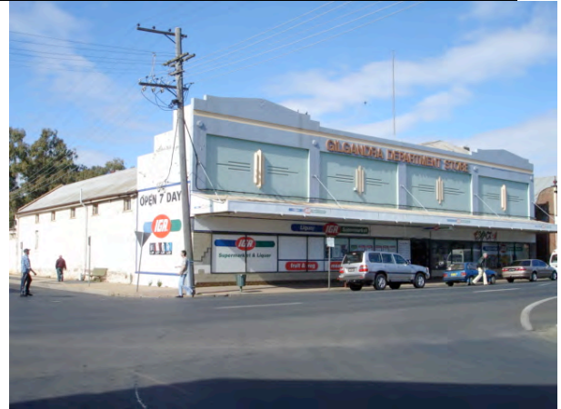
Plate 4.6: The former Western Stores on the corner of Miller and Bridge Streets.