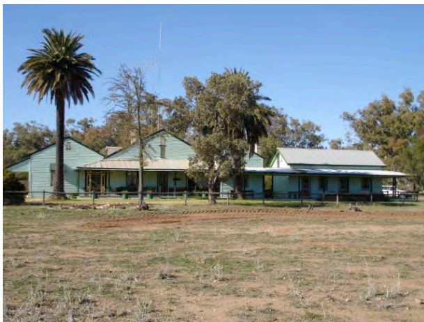
Plate 4.3: Berida Homestead.

The Pastoral and Agricultural landscape of Gilgandra Shire has undergone constant change since the 1830s. The story of the shire illustrates a continuum of change from large pastoral lease-holdings to substantial freehold properties that were gradually broken up through the late 19 th and early to mid 20 th centuries. Most early Pastoral holdings had a myriad of outbuildings and functioned effectively as small villages with store, housing of various types, schooling, wool shed, and private cemeteries. Many of these places today retain fine examples of great timber craftsmanship in both major and minor constructions, and reflect the energy and perseverance of strong individuals. Some notable examples can be found at Berida, Doorroombah and Weenya. Closer settlement created smaller holdings around locations such as Armatree, Biddon, Breealong and Tooraweenah. The woolsheds at Bearbong, Berida, Everleigh and Doorroombah help to represent changes in the scale of pastoral activity.