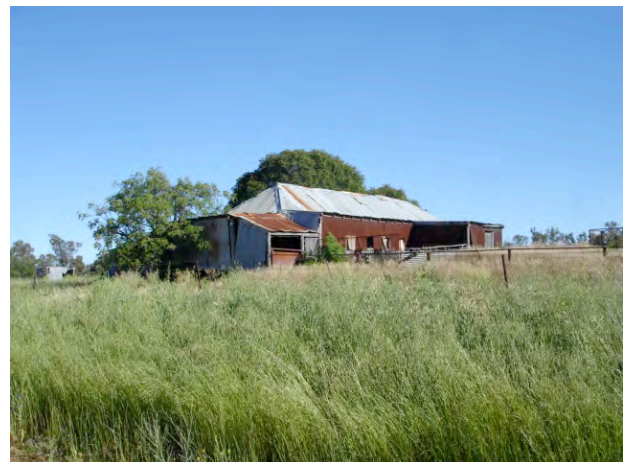
Plate 4.4: Bearbong Woolshed.