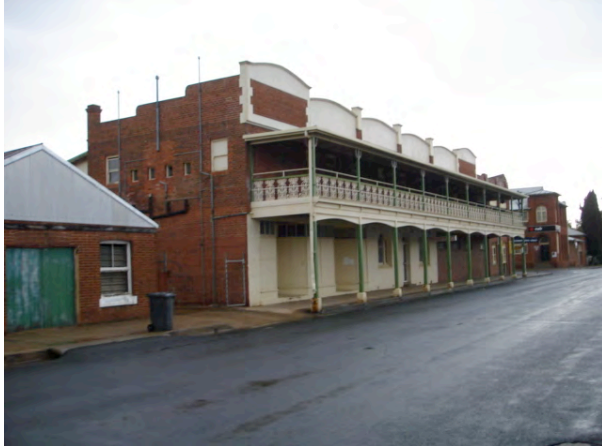
Plate 4.5: Royal Hotel frontage looking south along Bridge Street.