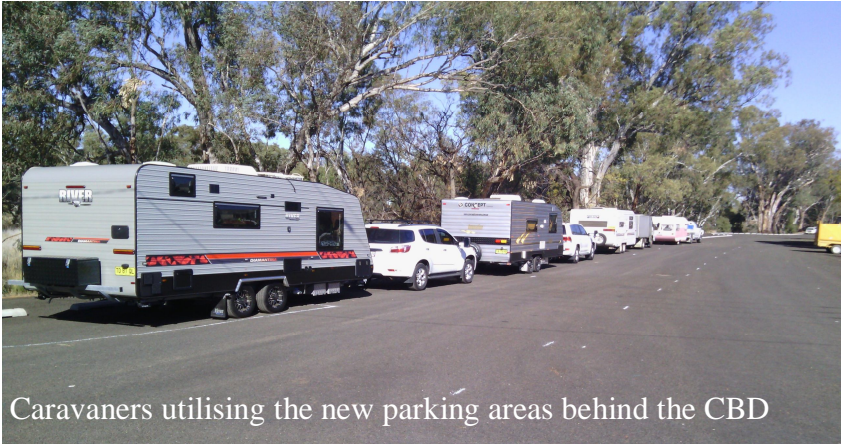
Caravaners utilising the new parking areas behind the CBD

Work on CBD Stage 2 project in Gilgandra is continuing with the area now open to the public. The dump point is now in working order, with delineators to the walking track and signage for caravan, dump point and tenant parking installed. Additional works are scheduled for November of this year including the final seal which will be followed by full line marking of the area, installation of roundabout roll over bumps and reseal of Bridge Street, including pavement upgrade.