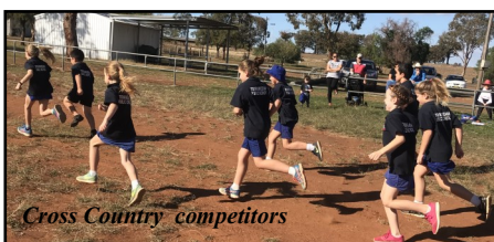
Cross Country competitors

The Tooraweenah Cross Country was held recently at the Tooraweenah Golf Course. Parents and community members came along and supported the students. Congratulations to the students who were