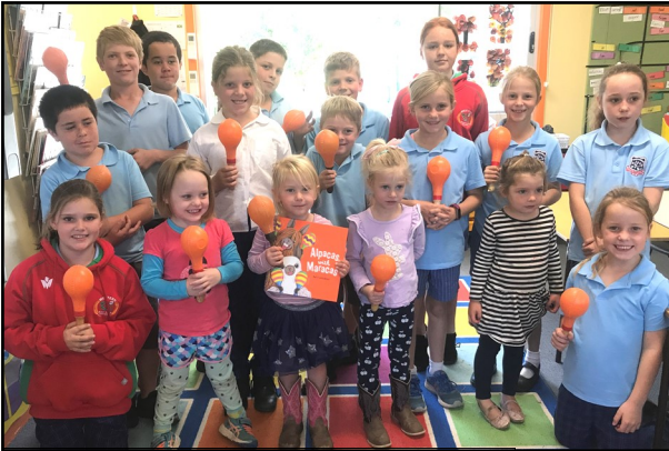
Simultaneous Story Time with students from Tooraweenah Public School and Preschool

Transition to School starts Monday 17th June for any Kindergarten students who will be, or are considering enrolling in Kindergarten 2020 for Tooraweenah Public School.