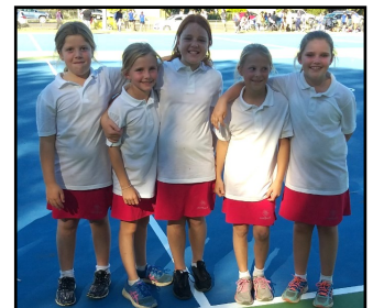
Some of the Small Schools' Sparklers Netball team