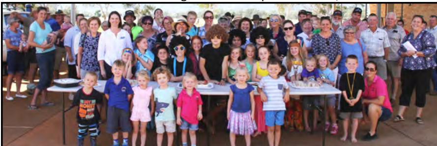
Grandfriends' Day 2018 Tooraweenah Public School