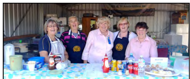
Tooraweenah CWA members catering for the Endurance Ride in the bar facilities at the Tooraweenah Showground