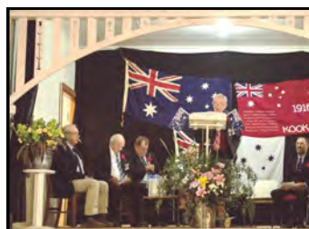
Scenes from the 2018 Tooraweenah Anzac Day Service